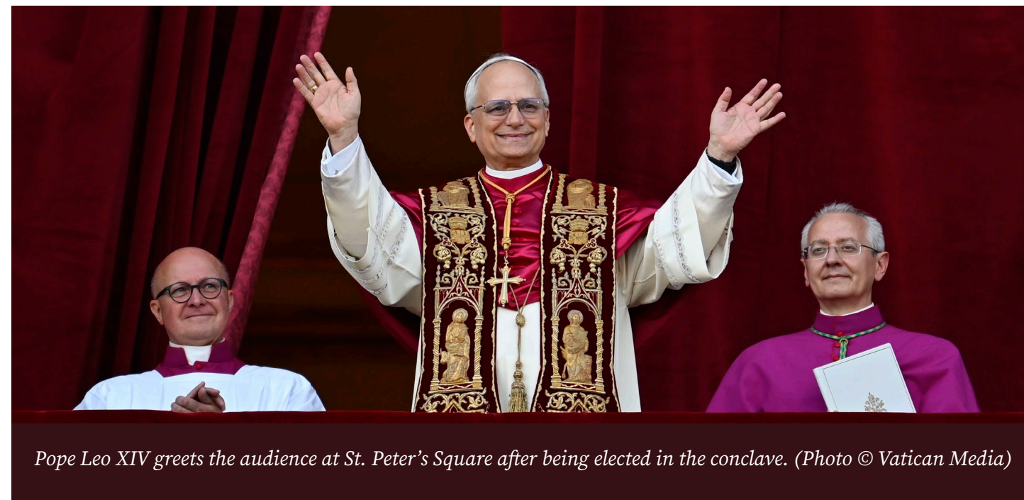
Pope Leo XIV greets the audience at St. Peter’s Square after being elected in the conclave.

man family, economics, to worker’s rights and human dignity.